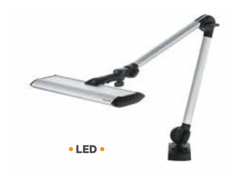
Workstation lamp Taneo

(Please always order mounting adapter of choice)