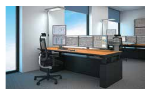
Knürr Console LED stand

• Wireless control Knürr Control LED to be ordered separately!