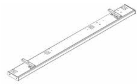
Workstation lamp (underfit)