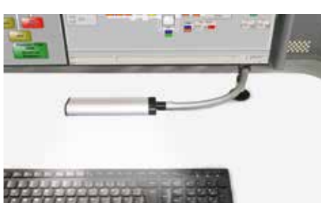
Knürr Task LED Flex