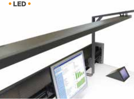
Knürr Lumax LED Lamp