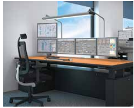
Knürr Console LED