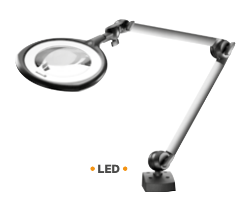
LED Magnifier Lamp "Tevisio"