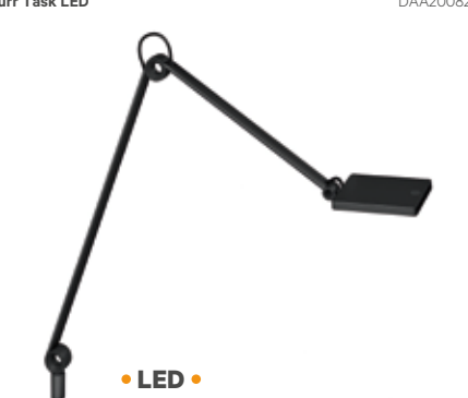
Knürr Task LED L DAA20083