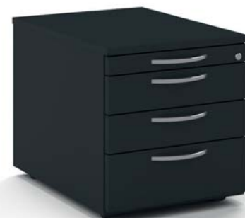
8 OU mobile office pedestal in version .9

Dimensions in mm: W= Width H = Height D = Depth OU = Office unit (50 mm) FH = Folder height, min. 325 mm / 12,8" Replace „x“ with the number of your color choice