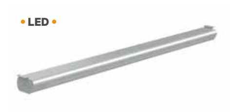
Knürr Smart LED