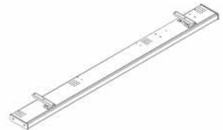
Workstation lamp (underfit)