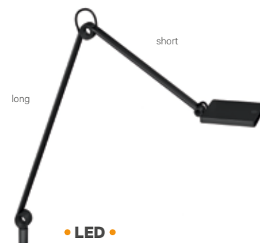
Knürr Task LED L