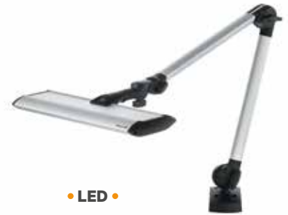
Workstation lamp Taneo