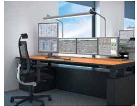
Knürr Console LED