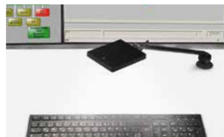
Knürr Task LED