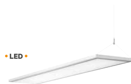
Knürr Console LED pendant