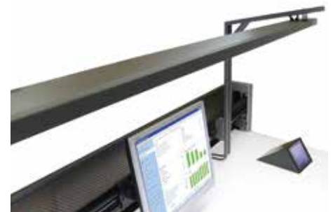
Knürr Lumax LED Lamp