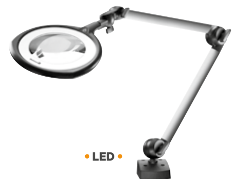
LED Magnifier Lamp „Tevisio“