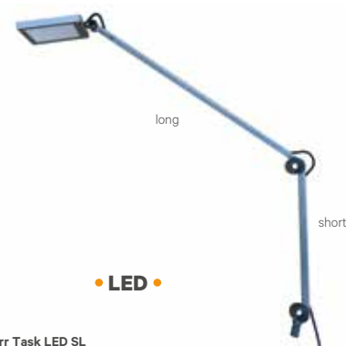
Knürr Task LED SL