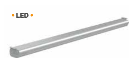
Knürr Smart LED