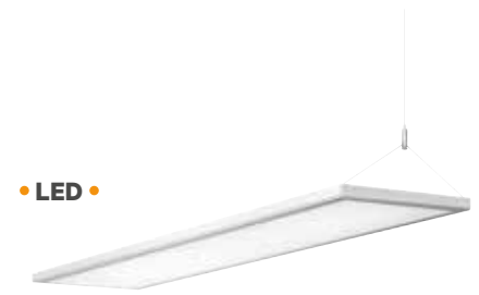
Knürr Console LED pendant